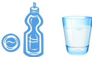
A bottle of water