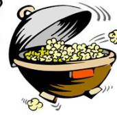
Air popped pop corn