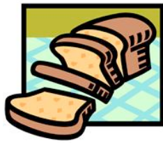
Bread, sandwiches, a wrap or rice.