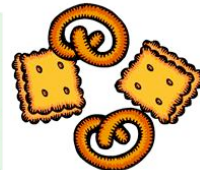
some other snacks